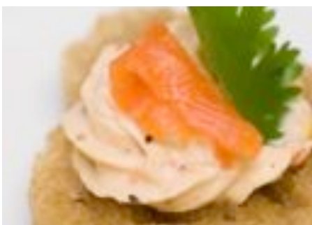
Table Harvest Lunch ~ up to three choices Dessert Twinings Tea or Vivace Coffee Menus Venue & Service